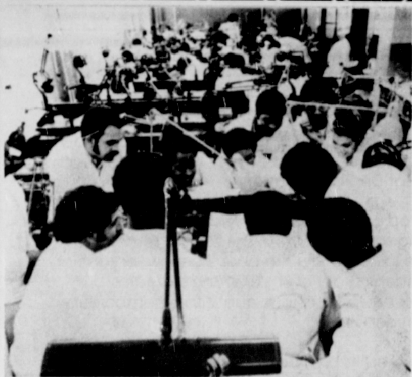
Meharry students participating in a laboratory session at the Nashville, Tenn., Dental School.