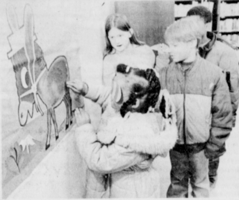
Children play game at the Albina branch library celebration of Martin Luther King, Jr.'s birthday.

The movement's beginnings in Selma, Alabama, were covered, as well as the historic year-long Montgomery bus boycott, racist Sheriff Bull Connor was shown leading his