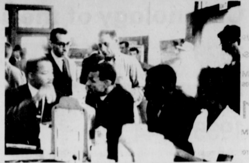
King participates in one of the many lunch counter sit-ins held during 1960.