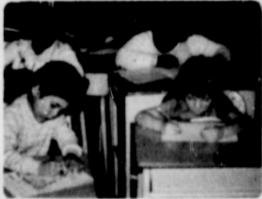
5-year old kids at Grace Collins Memorial Center study hard on school work before going outside to play.