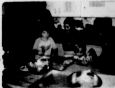
4-year old kids at Grace Collins Memorial Center learn how to make cookies.