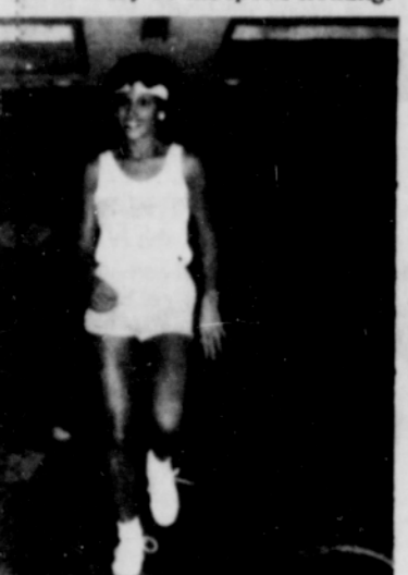
Model jogs in Nike outfit

For openers, the 10 young and shapely models and the three handsome male escorts jogged and exercised along the runway. All of them were clad in Nike active sports togs to show the dependability and high fashion of today's Nike sports clothing.