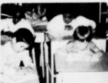
5-year old kids at Grace Collins Memorial Center study hard on school work before going outside to play.