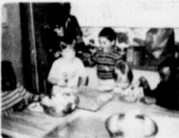
4-year old kids at Grace Collins Memorial Center learn how to make cookies.