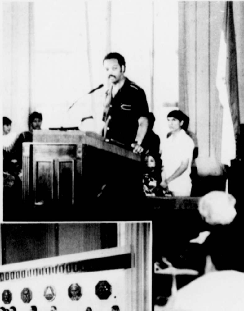
Jesse Jackson addresses the Nicaraguan Council of State during June 1984 visit.

predicted that "if attitudes persist of retaliation, domination, and occupation, our hemisphere could go up in flames." Jackson called for the "building of bridges" between Nicaragua and the U.S. as part of "the moral offensive" necessary for peace. Toward this process, he and the Nicaraguan National Government of Reconstruction reached nine points of agreement in areas of contention between the two countries. One point included the commitment to convene a summit meeting between the leaderships of the Nicaraguan government, the Protestant Church, and the Catholic Church, to promote dialogue. Other points concerned the reaffirmation of elections as scheduled in Nicaragua, the desire to proceed with negotiations with the U.S. at the bargaining table as opposed to the battlefield, and a commitment to pursue the Contradora process,