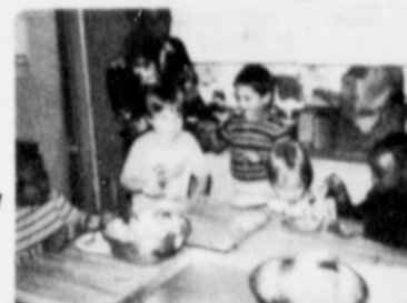
4-year old kids at Grace Collins Memorial Center learn how to make cookies.