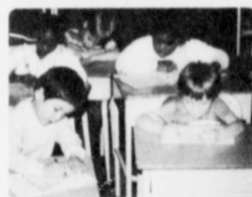
5-year old kids at Grace Collins study hard on school work before going outside to play.