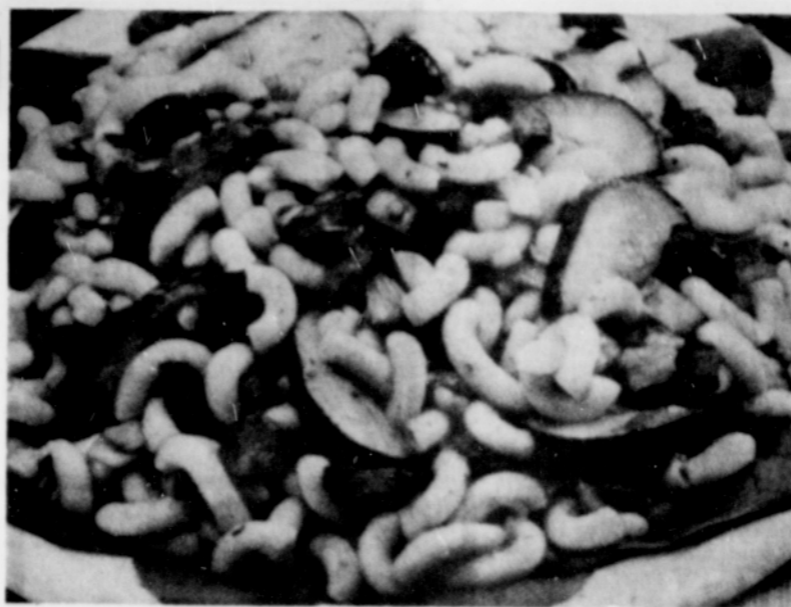
MEDITERANIAN MACARONI SALAD

To serve: Line large platter with lettuce leaves; spoon salad onto center of platter. Makes 5 cups or 6 servings.