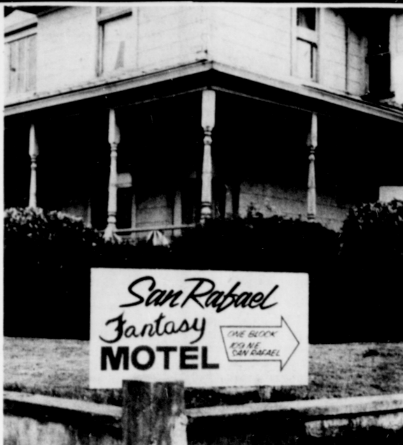
Sign on the corner of N.E. Rafael and Williams Avenue points to the former Desert Motel, now an adult business and source of neighborhood controversy.