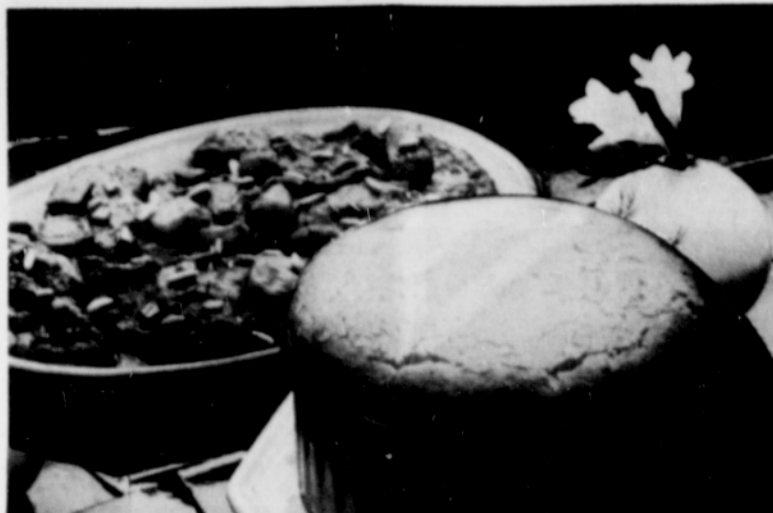
Offer Apricot Baked Chicken as a tangy entree for guests and family alike. It gets its spice from barbecue sauce along with apricots and pineapple chunks. As a contrasting, yet complementary, side dish present the elegant soufflé for a deliciously rich treat.

Combine cream cheese and margarine, mixing at medium speed on electric mixer until well blended. Add sour cream, eggs, sugar, juice and salt; mix well. Fold in noodles; pour into 5-cup soufflé dish. Bake at 325°, 1 hour and 30 minutes. Makes 8 servings. Variation: Substitute 1-1/2-qt. soufflé dish for 5-cup soufflé dish. Bake at 325°, 1 hour and 20 minutes.