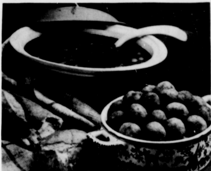
Play to rave reviews when your family enjoys Hollywood Ham Hocks and Chicken Fritters.

Noah Webster spent 20 years working on his famous American Dictionary of the English Language.