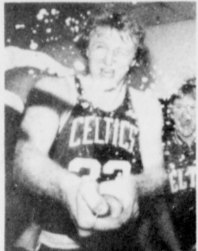
Larry Bird demonstrates just why champagne goes so well with champions.

Boston's all-pro forward Larry Bird and the Laker's all-pro guard Magic Johnson carry the load for their respective teams. For the past three years, they have been the subject of many debates concerning which is the better player. If Sun's coach John Macleod had a vote, here's how it would go: "I'd take Magic, said Macleod, I know Larry Bird had an outstanding year, and so has Bernard King.