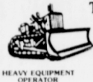
HEAVY EQUIPMENT OPERATOR