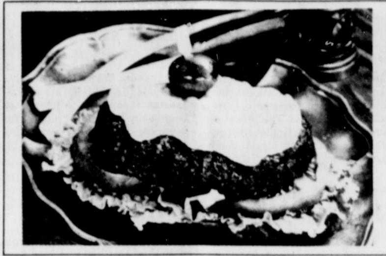
BALBOA PARTY BURGERS

Combine mayonnaise, sour cream, onion and parsley; mix well. Shape meat into six oval patties. Broil on both sides to desired doneness. Season with salt and pepper. Top patties with sauce and cheese; broil until cheese is melted. Spread toast with margarine; top with lettuce, tomato and patties. 6 servings.