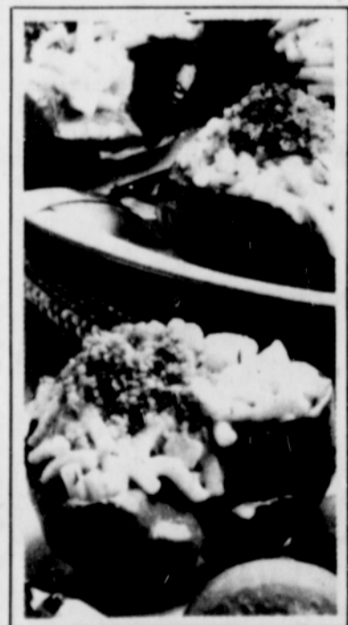
MACARONI PEPPER BOATS

6 servings. Microwave: Cook peppers as directed. Microwave 3 cups water and 1/2 teaspoon salt in covered 2-quart casserole or bowl on High 7 to 9 minutes or until boiling. Add macaroni; stir. Microwave uncovered 8 to 9 minutes or until tender, stirring after 4 minutes. Drain. Add margarine, milk and the cheese sauce mix; mix well. Add cottage cheese, onion and seasonings; mix well. Continue as directed. Microwave 8 to 10 minutes, turning dish after 5 minutes.