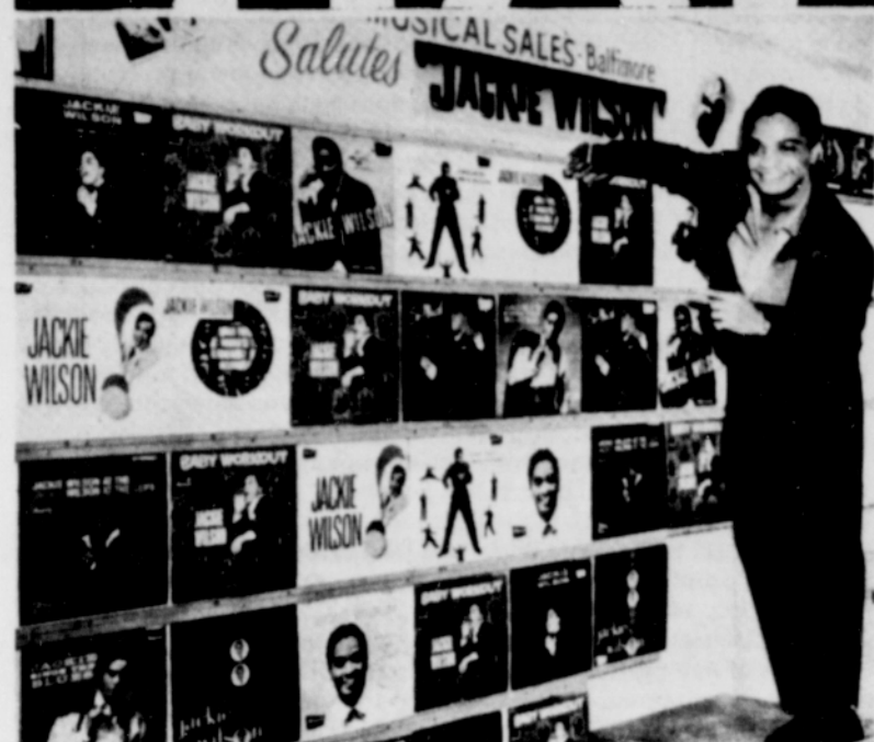
Jackie Wilson takes time out from a busy day to look at his display of hit albums.