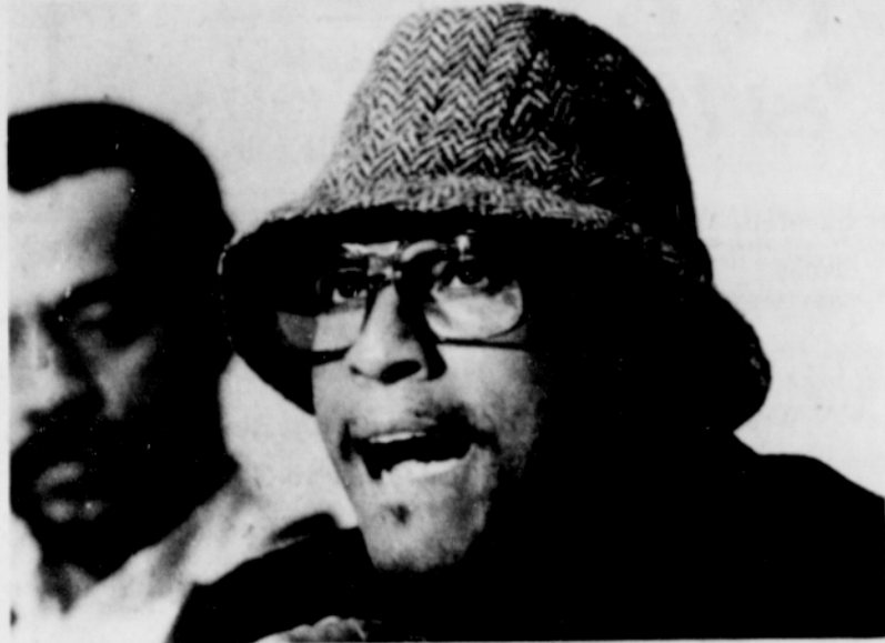
Sammy Strain, singer with the O'Jays, calls for an academic, cultural, and sports boycott of South Africa at Portland press conference.

mainly Black, but whites control the economic, political and social aspects of everyday life. The majority live below the poverty line and the infant mortality for urban Blacks is 69 per 1,000 and 282 per 1,000 for rural Blacks. Blacks cannot vote, or hold office, and their land has been taken away by the government, forcing them to live in camps where hunger and disease are commonplace.