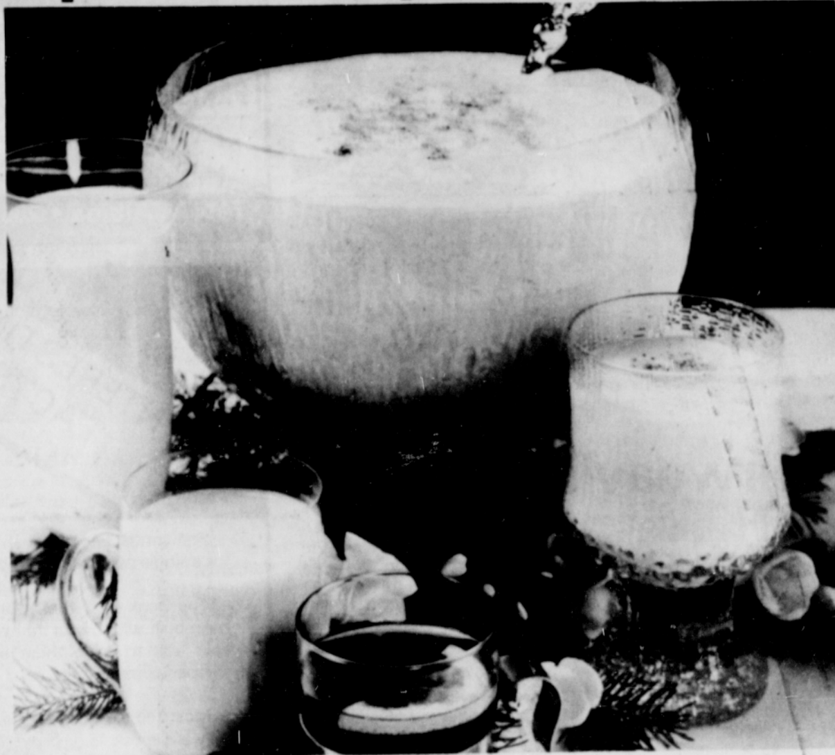
Bracing hot drinks and soothing chilled ones for holiday entertaining have a condensed soup base. From foreground moving clockwise they are: Honey of a Toddy, Great Glogg, Island Holiday Delight, Eggnog Elegante, and Tim and Jerry.

Tim and Jerry combines rum and brandy with condensed Cheddar cheese soup, eggs, sugar and a touch of vanilla. The batter and rum-brandy mixture are stirred into cups and boiling water is added for a new version of the Tom and Jerry.