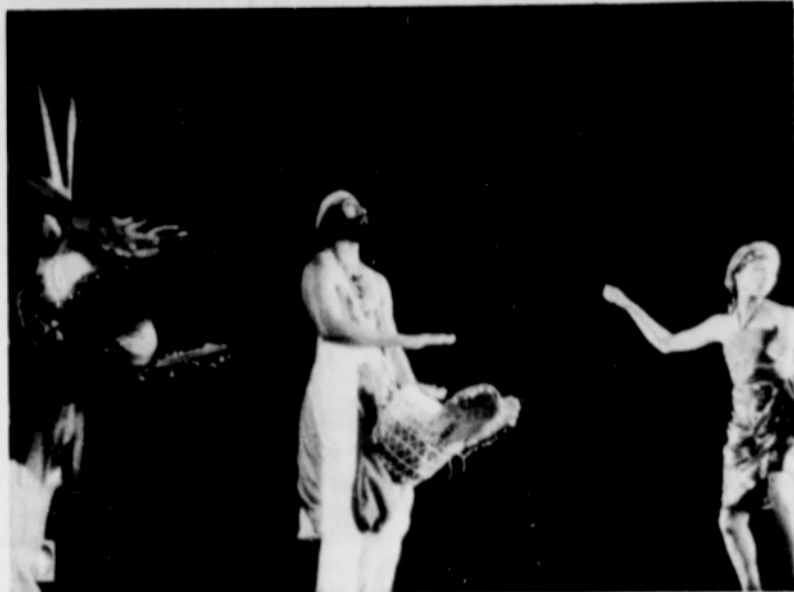
The Northwest Afrikan/American Ballet will perform traditional music and dances at Jefferson High next Saturday night.