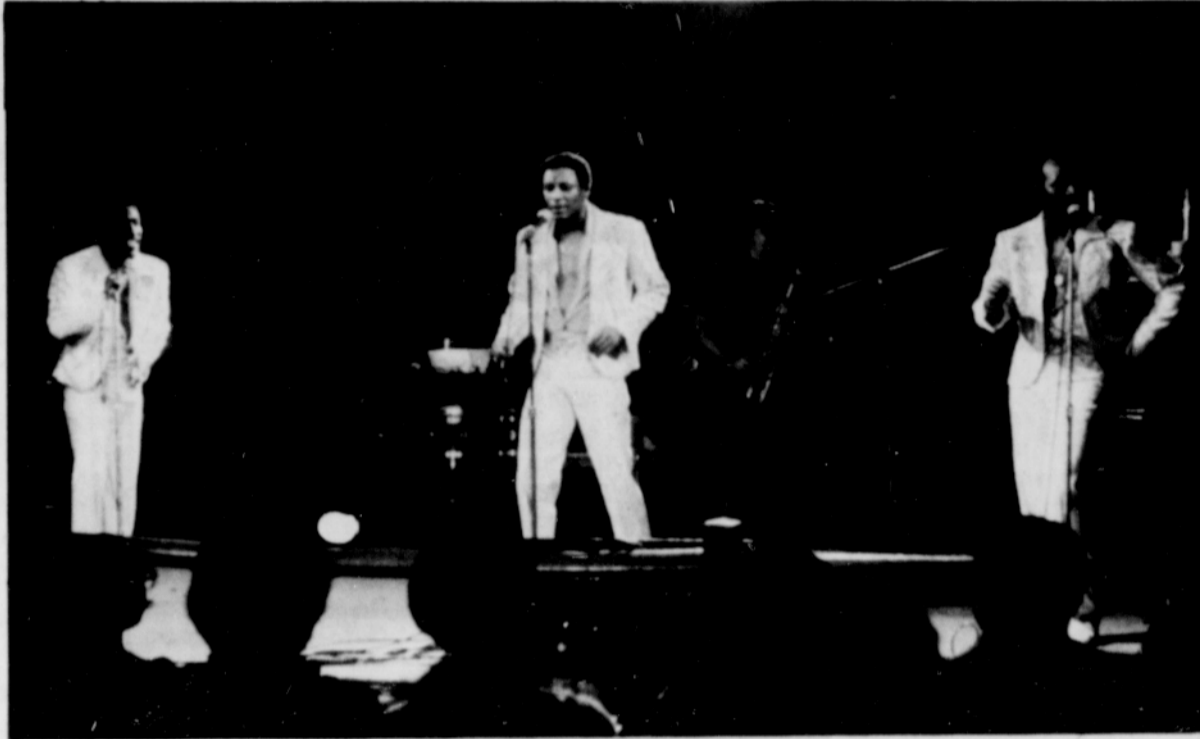
O'Jays perform at controversial concert at Starry Night last week. While in Portland, the O'Jays spoke in favor of cultural and sports ban of South Africa.

At 10:45 the O'Jays came out to perform in front of a hostile crowd which cooled off with each successive medley. At 11:30 the O'Jays left the stage, giving people the impression that they would be back for a