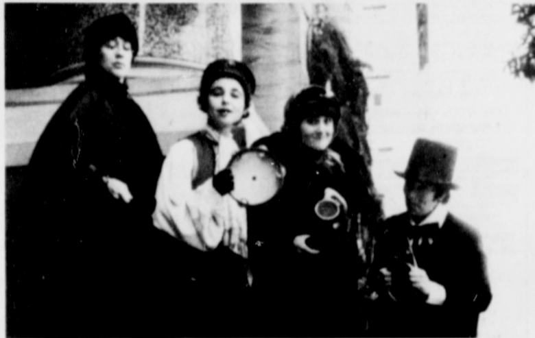
The Fallen Angel Choir will perform at the Firehouse Theater's Christmas Show on December 16, 17 and 18; 8:00 p.m., at 1436 SW Montgomery.

Decorating of Christmas trees by ethnic groups in costume : Nationality groups will come in colorful costumes to decorate trees in the styles of their heritages. There will be live music and free punch and cookies. Begins at 1:00 p.m. in the main Exhibit Hall. Regular Forestry Center admission. (The trees will remain on display through New Year's Day.)