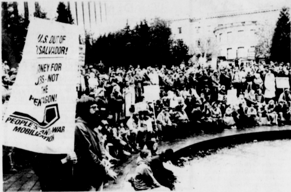
Undaunted by Saturday's torrential rains, over 1,000 people filled Terry Schunk Plaza to protest U.S. policy in Central America and the Caribbean.