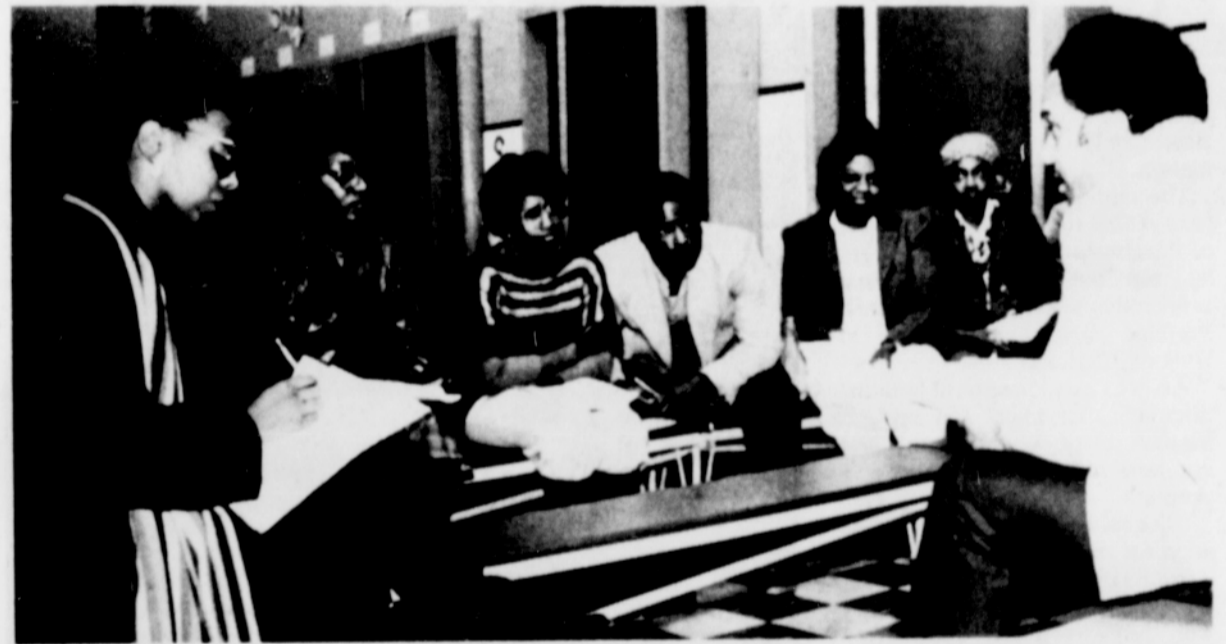
Low achievement scores of Black public school students brought parents together in Black United Front-sponsored workshop to learn how to help

"The President's compliance with the laws of the land is fundamental to the integrity of the Executive Office. Public approval of the President's military actions does not diminish the basic constitutional and legal issues at stake. To the contrary, current public silence in and outside of Congress makes it doubly important to scrutinize the President's conduct. Impeachment is a final congressional remedy for judging this pattern of action and for generating broad public debate on (Please turn to page 10 column 1)