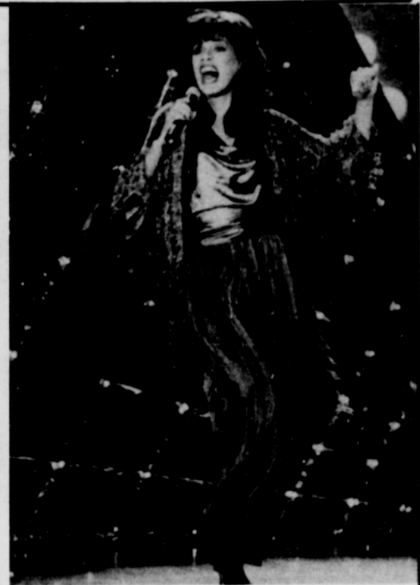
PARADE OF STARS EXCITEMENT—“Solid Gold” television show host Marilyn McCoo adds to the excitement of the “Lou Rawls Parade of Stars” as a performer and as co-host with Lou Rawls and Ed McMahon. The three-hour entertainment spectacular benefits the United Negro College Fund.

Saint Paul's College (Lawrenceville) Virginia Union University (Richmond)