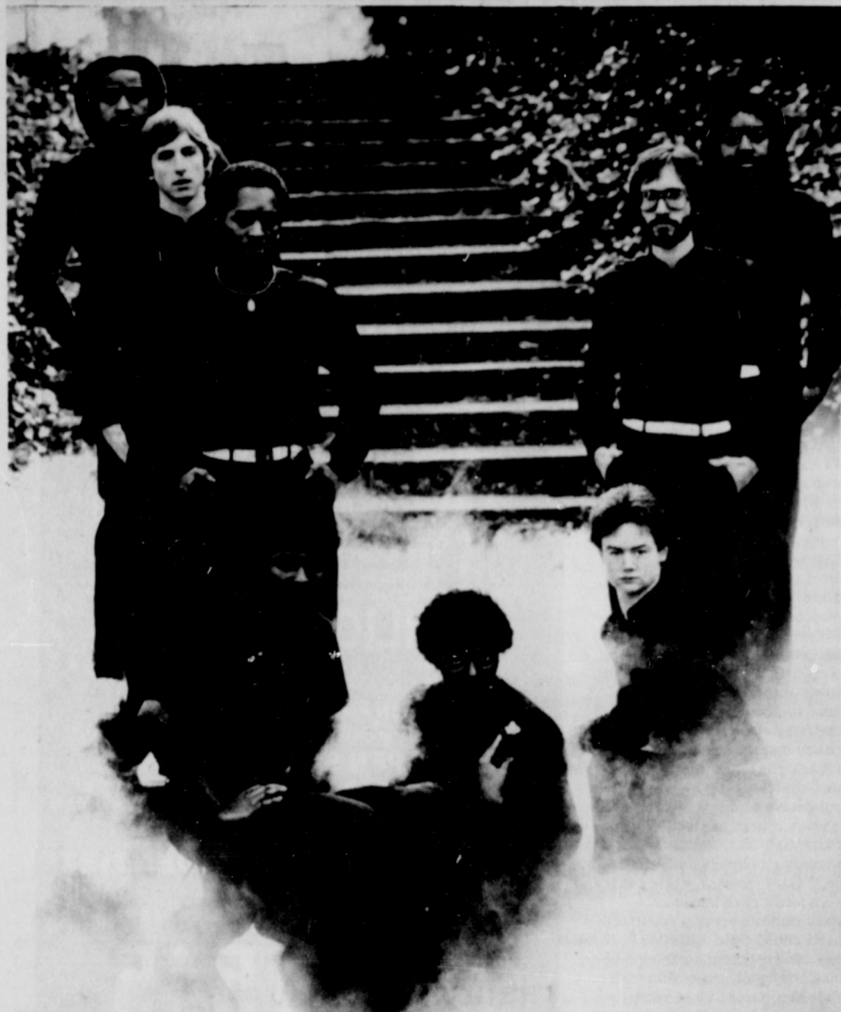
Velvet, one of Portland's Number One bands, will be at Jamie's Place, Friday, Oct. 14th and Sat., Oct. 15th, 1983—two great nights of music for the soul of people. Don't miss the great live, live