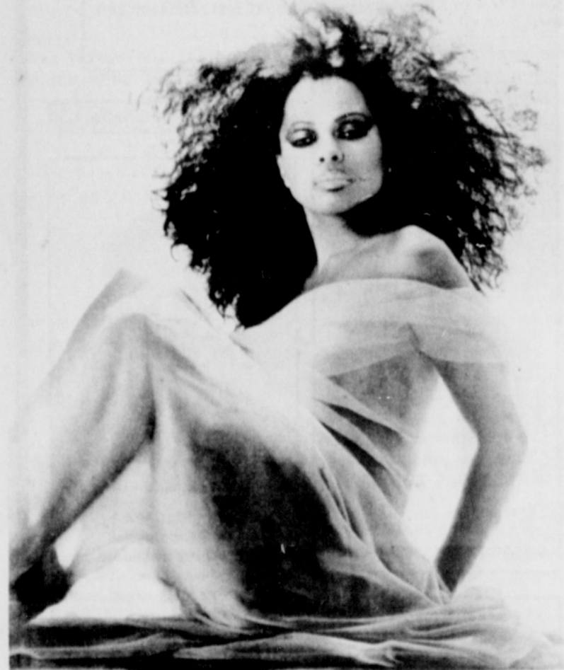
Diana Ross will be at the Memorial Coliseum Oct. 17th, at 7:30 p.m. Ticket prices are $12.50 and $15.00. Tickets can be picked up now at the Memorial Coliseum box office.

Closed Sun. & Mon. OPEN Tues. thru Sat. 11:30 AM to 6:00 PM