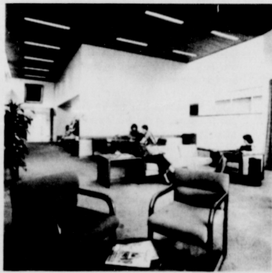
An inside look at the new Bess Kaiser Medical Center.

Our Bess Kaiser Medical Center renovation is now complete.