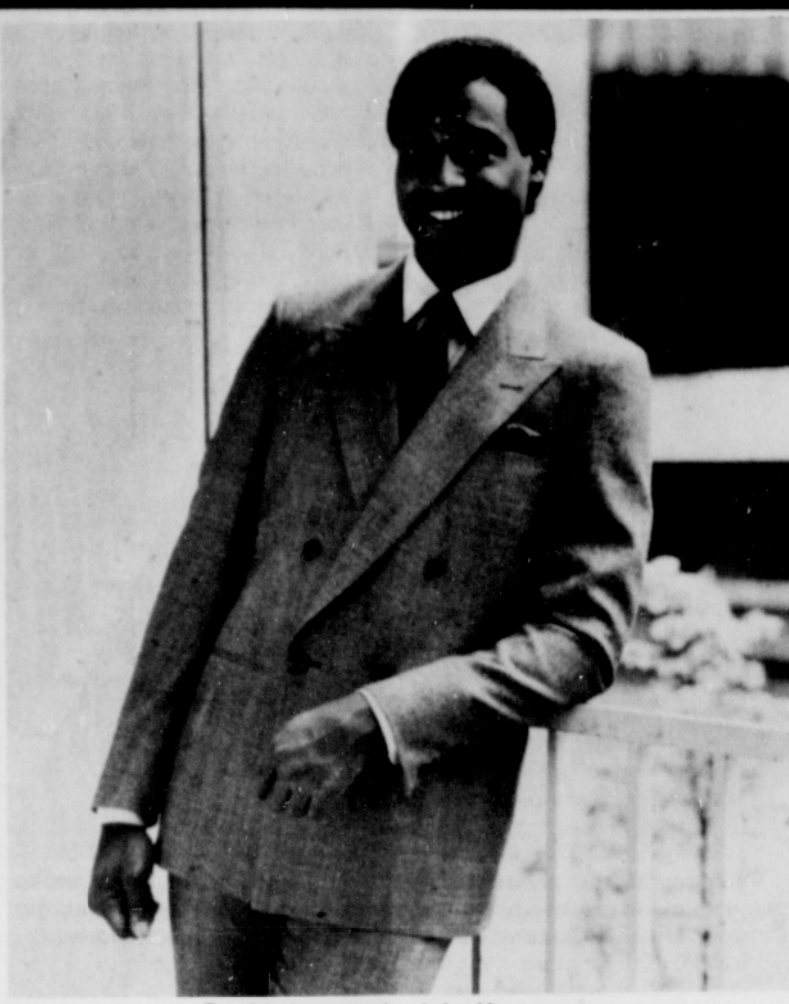
Double breasted suit by Hartmarx.

the '40s through the '70s, few men wore them. But for the last three or four seasons, there has been a double breasted revival, and there is every indication that it will be double strong this fall. It's a fresh garment for the younger man because there's a whole new generation of men that have never worn double breasted suits or sports coats... It also coincides with the new silhouette—a broad, easier shoulder and tapered waist. A double breasted suit gives a man a look of importance and authority, as well as being elegant and flattering. Almost any man can wear one provided the suit or sport coat is well made and the balance is right.