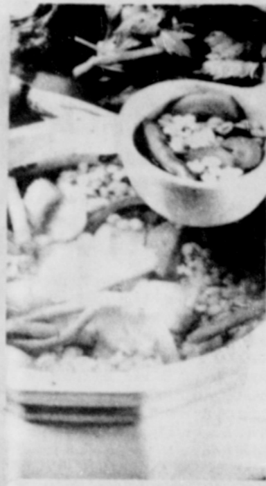
Autumn Vegetable Soup

Combine water, ham hocks, bouillon cubes, garlic and pepper in 4 1/2-qt. Dutch oven. Bring to a boil. Reduce heat. Cover; simmer 3 hours or until ham hocks are tender. Remove ham hocks; trim meat and add to soup, if desired. Add barley; cover. Return to a boil; simmer 20 minutes. Add vegetables and parsley. Cover; continue simmering 20 to 30 minutes or until barley and vegetables are tender. Skim fat, if necessary. Makes 8 to 10 servings.