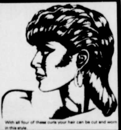
With all four of these curls your hair can be cut and worn in this style.

For more details on our Back to School Special and Nexus hair color demonstrations ask for Sabrina.