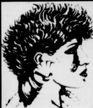
With all four of these curls your hair can be cut and worn in this style.

Curls $25 00 and $35 00 for short & med. hair Reg. $55 00 for long hair