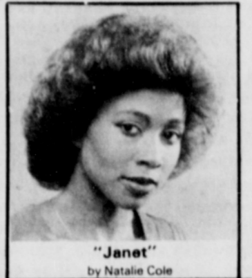
"Janet" by Natalie Cole