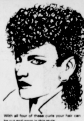
With all four of these curls your hair can be cut and worn in this style.