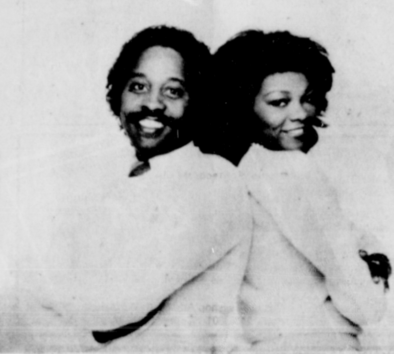
YARBROUGH & PEOPLES

"Our big break," says Alisa, "came one night when we were playing at a club in Dallas. We were always hoping to be discovered when The Gap Band came in. After that, things started to happen fast!"