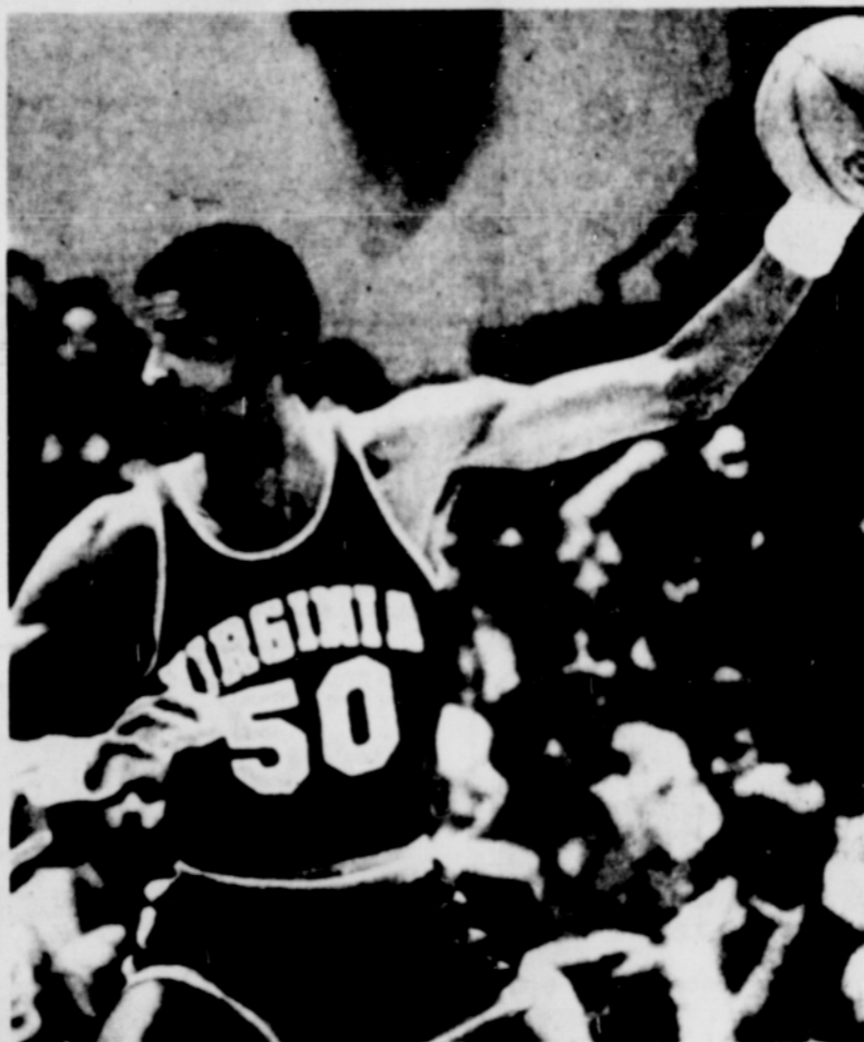
RALPH SAMPSON: Houston's No. 1 pick

An "Interdependence Day" Celebration and Pot Luck Picnic sponsored by a coalition of peace groups will be held in Laurelhurst Park on July 4th, from noon to 5:00 p.m. There will be jazz, folk, and ethnic music, as well as speakers. For info. call 641-8915.