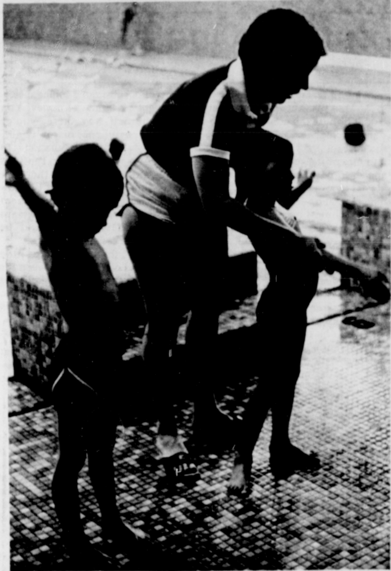
Learn to swim during the YMCA/YWCA "Learn to Swim Week", June 6th through 10th. Swimming is important for safety and recreation. (See coupon on page 2)

The savings will make you warm all over. NORTHWEST NATURAL GAS Portland 226-4211 Lincoln City 994-2111 Albany 926-4253 Salem 585-6611 Astoria 325-1632 The Dalles 296-2229 Eugene 342-3661 Vancouver 693-2511