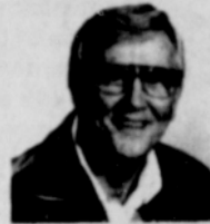
Two-Time National "Coach of the Year"

FOR BOYS & GIRLS 9-18 June 26-July 1 July 24-July 29 Aug. 7-Aug. 12