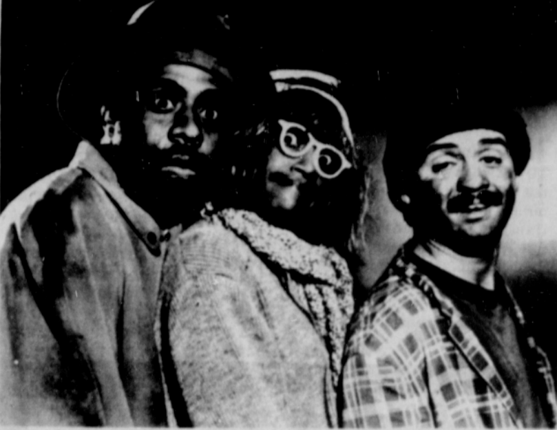
WOULD YOU TRUST THE FUTURE OF THE PLANET TO THESE THREE? Sedro (aka FACTWINO), his buddy, Buddy (center), and the Spirit of Information (right) take on the mightiest foe of them all, ARMAGEDDON-MAN!!!