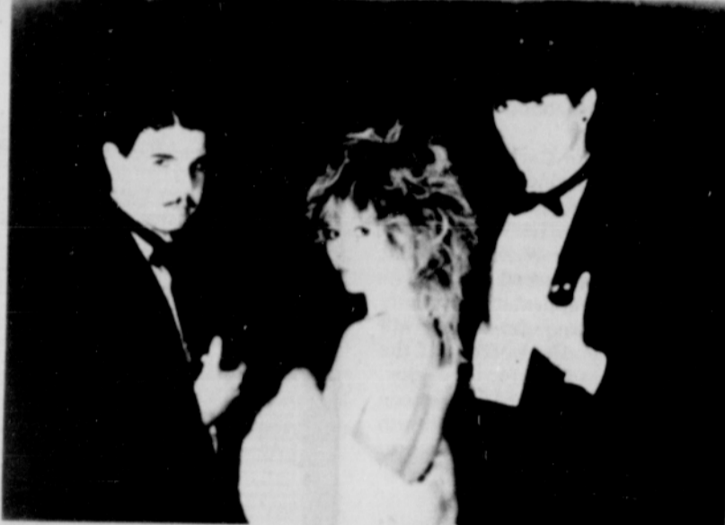
Berlin, along with special guest Map of France, will be at the Euphoria May 14, 1983, at 9:00 p.m. Tickets will be $8.50. Pick up your tickets today at Everybody's Records, Music Millennium, Frederick and Nelson downtown, Singles Going Steady and Rock-n-Roll Fashions.

Berlin's EP, Pleasure Victim , is a seven song tour-de-force laden with melodic pop hits. Recorded in the spring of 1982, Pleasure Victim was initially released on the small, independent M.A.O./Enigma label in September of that year. Almost immediately it began attracting widespread attention, both in alternative record stores and on the airwaves. In the first ten weeks of its release it sold over 25,000 copies and became one of the top fifteen best-selling discs in the L.A. basin. Radio stations from coast-to-coast put Pleasure Victim on the heaviest of rotations. From apparently out of the blue, Berlin had arrived to take the musical community by storm. Now Geffen Records has re-released Pleasure Victim and signed Berlin to a long-term recording contract. It has indeed been an eventful few months for a remarkable and provocative band.