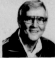
Two-Time National "Coach of the Year"

CALL OR WRITE TO: BEAVERS BASKETBALL CAMP 135 GILL COLISEUM, CORVALLIS, OR. 97331 • 754-2076