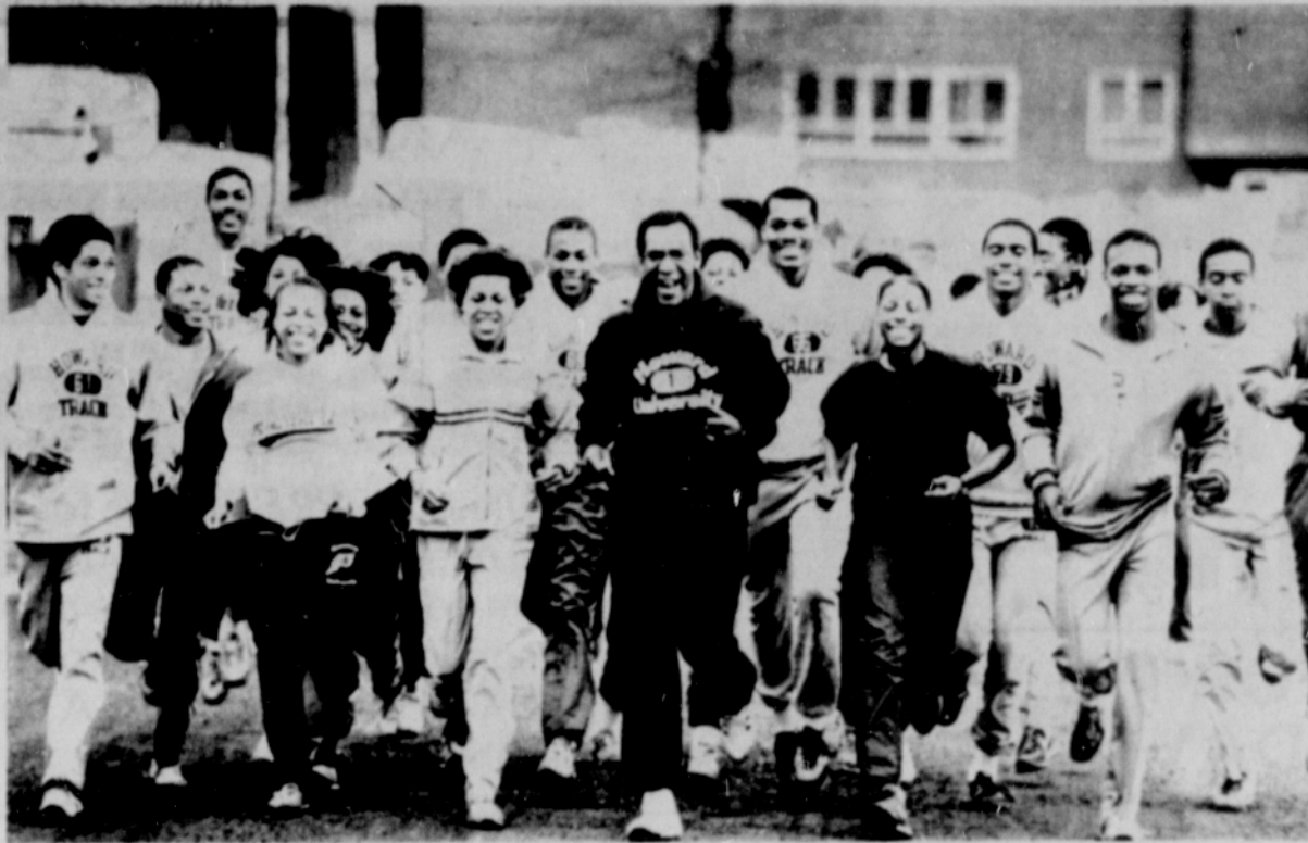
EXERCISE: Bill Cosby runs with youngsters participating in Howard University athletic program.

Jackson's Owl Radio T.V. and Record Co. 4823 N. Vancouver