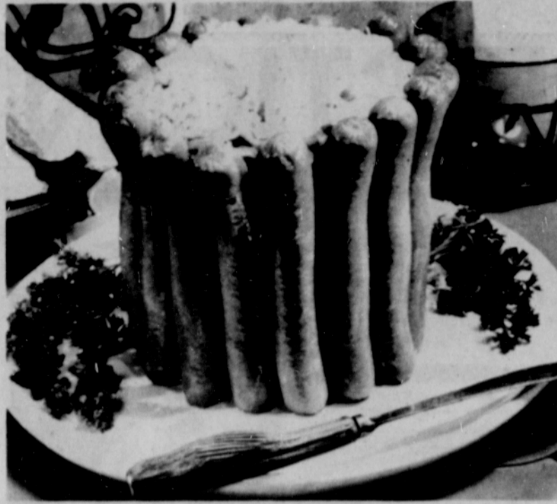
Frankfurter "crown roast" with sauerkraut

Heat butter or margarine in a heavy 10- to 12-inch skillet. Combine potatoes, onion and pepper; add to skillet. Press potato mixture firmly and evenly over bottom of skillet. Cook over medium-high heat, without stirring, until a brown crust forms on the bottom, about 10 minutes. Mix together kraut, frankfurters and sugar; spread evenly over potatoes in the skillet. Reduce heat; cover and cook 10 to 15 minutes, or until kraut is heated through. Run spatula round edge of skillet. Turn out onto large plate or serve from skillet. Makes 4 servings.