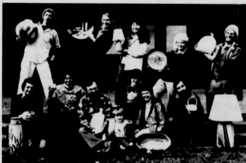
Ceramic Showcase '83 will exhibit the finest new work by over 70 Northwest artists working in clay. The showcase takes place at the Western Forestry Center, 4033 S.W. Canyon Road, Portland, Oregon on Friday and Saturday, April 29th and 30th, 1983, from 11 a.m. to 9 p.m. (Fri.) and 10 a.m. to 6 p.m. (Sat.).

Tracing the roots of kissing becomes more serious business. Egyptologists say that the ancient Egyptian word for "kiss" and "eat" are the same. Sigmund Freud wrote that the kiss "is held in high esteem among many nations, in spite of the fact that the body parts involved constitute the entrance to the digestive tract." Perhaps this kissing/eating correlation is the basis for a well-known saying attributed to George Meredith: "Kissing don't last; cookery do!"