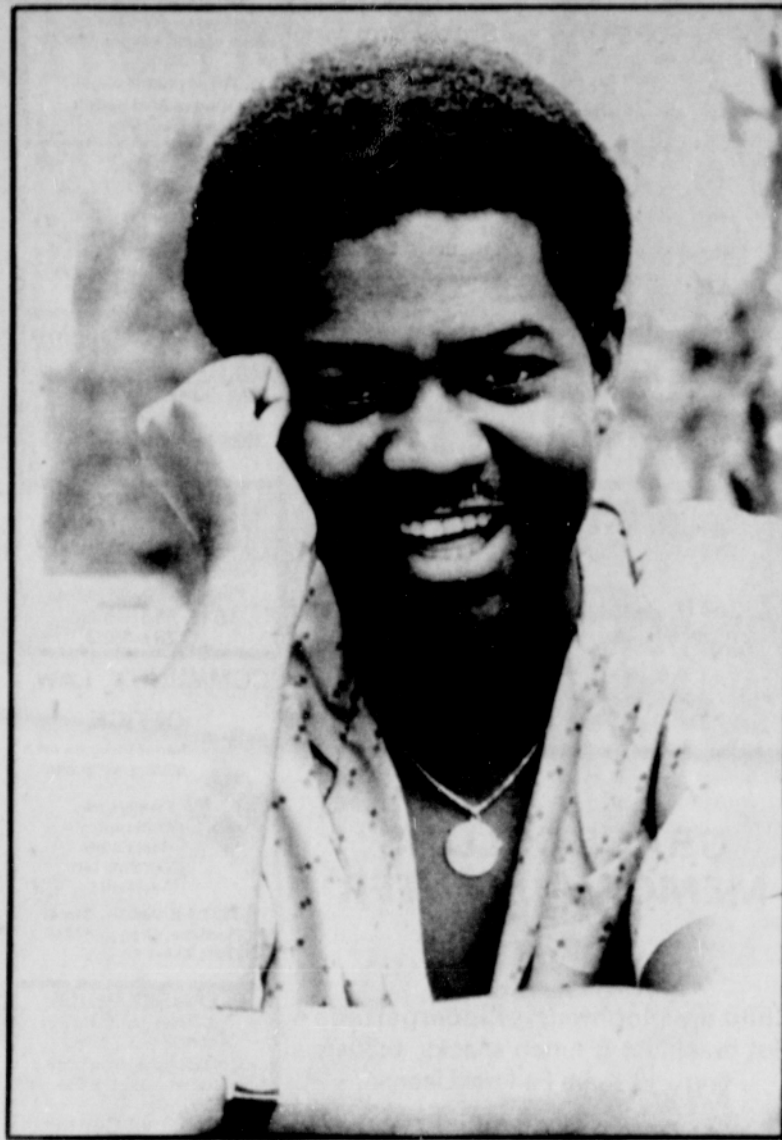
Pop guitar wizard Earl Klugh makes his Portland debut at Lewis & Clark's Pamplin Center on Tuesday, April 19 for one performance only at 8 p.m.