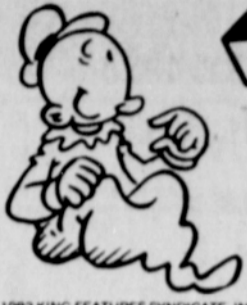
© 1982 KING FEATURES SYNDICATE, INC.