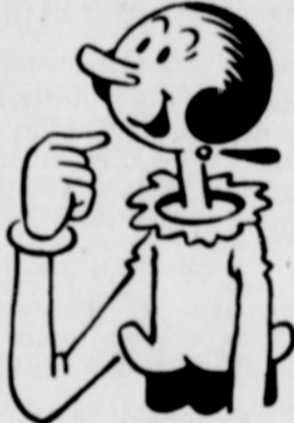
© 1982 KING FEATURES SYNDICATE, INC.