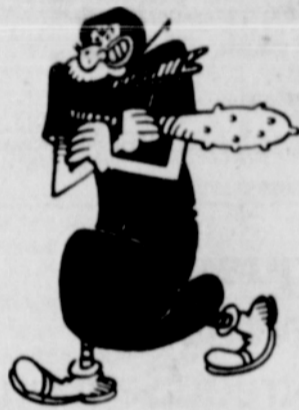
© 1982 KING FEATURES SYNDICATE, INC.