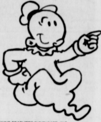
© 1982 KING FEATURES SYNDICATE, INC.