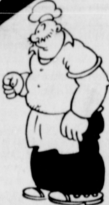
© 1982 KING FEATURES SYNDICATE, INC.

COLESLAW PUDDING!!! DRINK!!!!!!! BEANS!!!!!!! PIE!!!!!!!