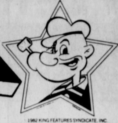
© 1982 KING FEATURES SYNDICATE, INC.

Eat your heart out Colonel — everyone knows ... if it ain't POPEYE's® Spicy Chicken™, it just ain't chicken.