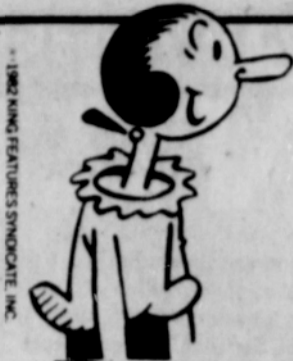
© 1982 KING FEATURES SYNDICATE, INC.

Please present this coupon to cashier before ordering. One coupon per customer per visit please. Void where prohibited. Offer not valid with any other promotional purchase. Cash redemption value 1/20¢. Expires May 15, 1983.