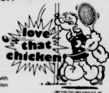
© 1982 KING FEATURES SYNDICATE, INC.

Please present this coupon to cashier before ordering. One coupon per customer per visit please. Void where prohibited. Offer not valid with any other promotional purchase. Cash redemption value 1/20¢. Expires May 15, 1983.