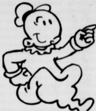
© 1982 KING FEATURES SYNDICATE, INC.