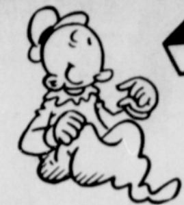
© 1982 KING FEATURES SYNDICATE, INC.

Popeye's Original Spicy Chicken is so good now even the Colonel is trying to do it.