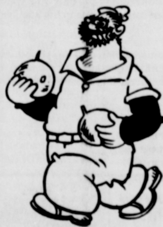
© 1982 KING FEATURES SYNDICATE, INC.

COLESLAW PUDDING!!! DRINK!!!!!!! BEANS!!!!!!! PIE!!!!!!!