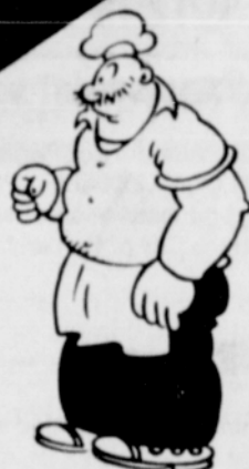
© 1982 KING FEATURES SYNDICATE, INC.

COLESLAW PUDDING!!! DRINK!!!!!!! BEANS!!!!!!! PIE!!!!!!!