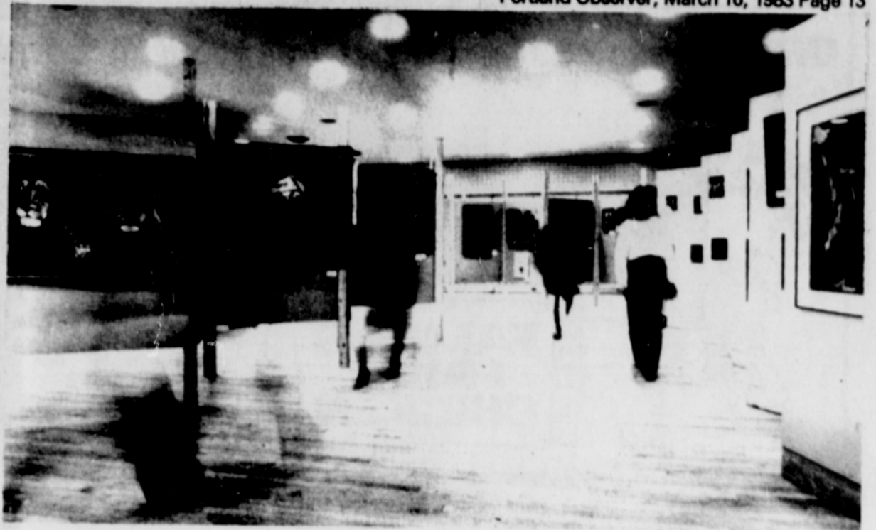
Works of the Members Gallery are displayed at Portland State University.