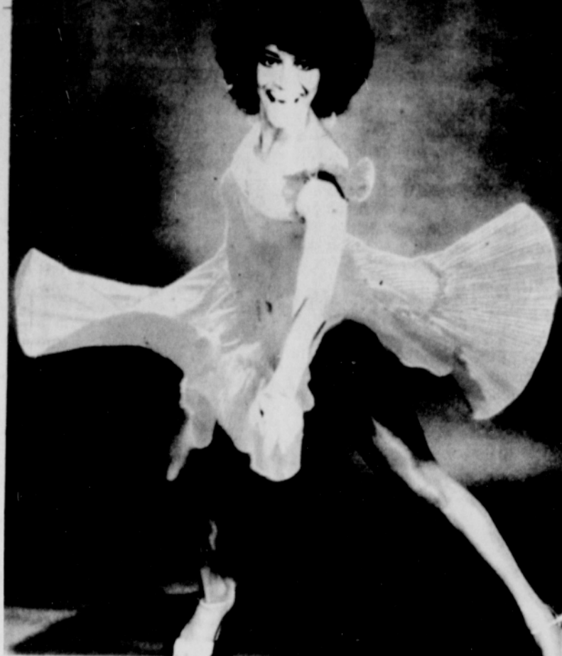
Vibrant Debbie Allen of TV's Fame is a knockout on-stage as well

Remember, stop into any Popeyes Famous Fried Chicken location and drop your classified ad into the Special Popeyes Classified box. It's free - from Popeyes Famous Fried Chicken.