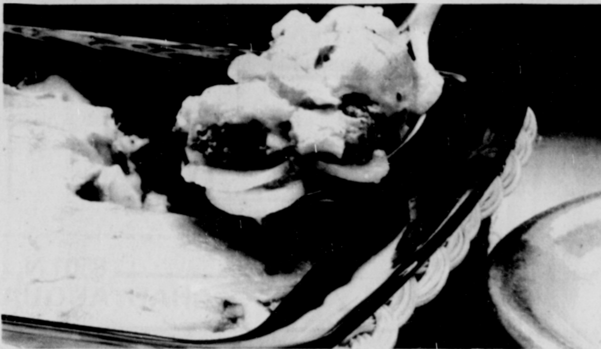
TURKEY AND TATERS: Leftovers never tasted so good. This economical Turkey-Potato Casserole combines meat, potatoes and vegetables in one delicious dish.

Heat oven to 375°. Cook and stir celery and onion in 2 tablespoons margarine in 10-inch skillet until tender. Stir in Sauce Mix, milk and mustard. Heat to boiling, stirring constantly; reduce heat. Simmer uncovered until sauce is thickened, about 5 minutes. Stir in turkey. Pour turkey mixture over broccoli. Bake uncovered 25 minutes. Sprinkle with Cheddar cheese; bake until cheese is melted, about 5 minutes longer. Let stand 5 minutes before serving. Six servings.