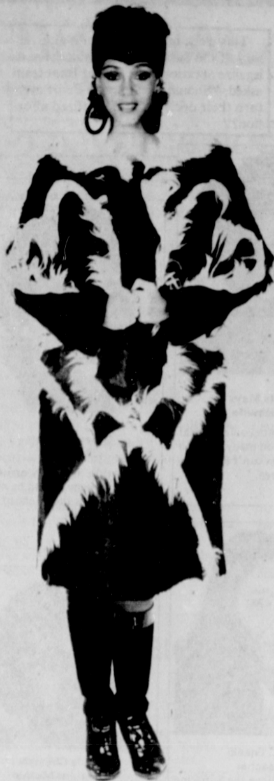
Sensational goatskin coat modeled by Pamela Brame of Ebony Fashion Fair is worn with wool & leather skirt, leather wrap top and leather hat.