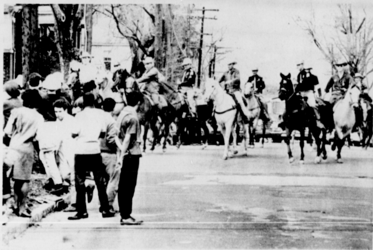
Mounted Alabama State Patrolmen and local deputy sheriffs disperse demonstrators in Montgomery. An estimated 600 persons sat in the street to protest Alabama voter registration procedures. Eight or more were hospitalized.

"I have the audacity to believe that peoples everywhere can have three meals a day for their bodies, education and culture for their minds, and dignity, equality and freedom for their spirits."