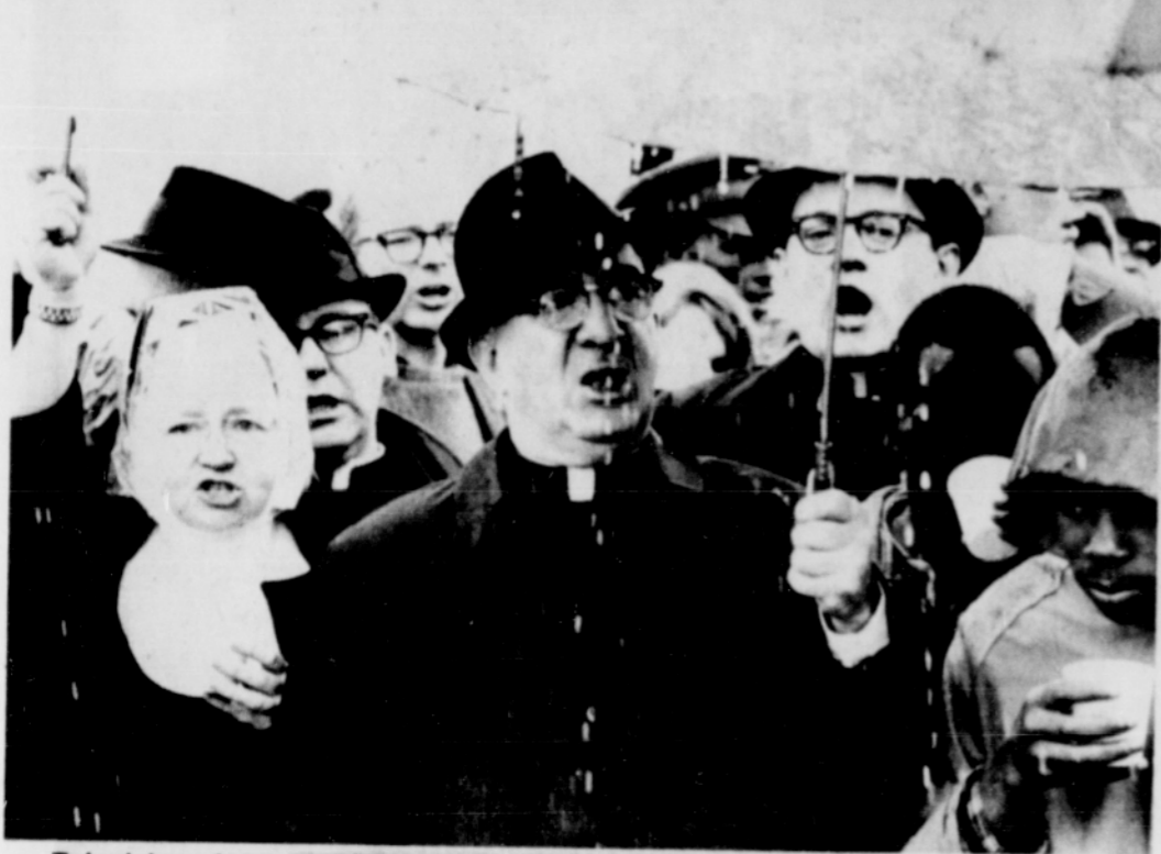
Television pictures flashed around the world and a call for Northern clergy brought hundreds of supporters.