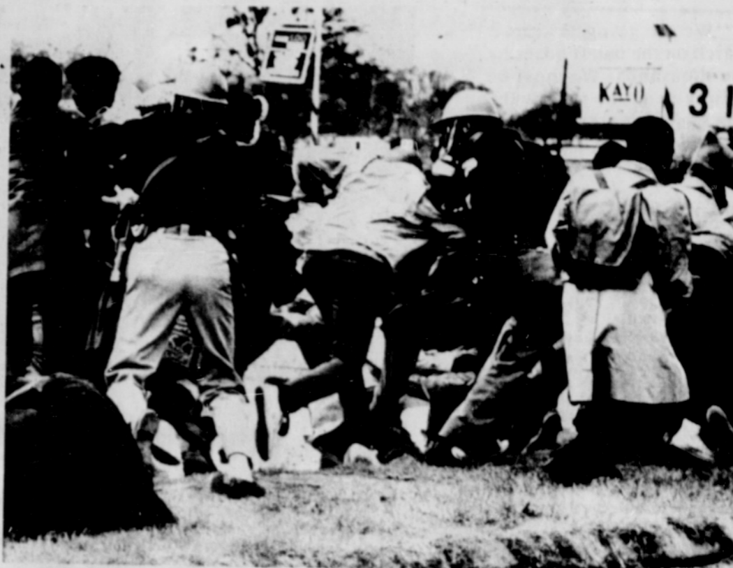
Tear gas and clubs were used on demonstrators by State Troopers sent by Alabama Governor George Wallace.