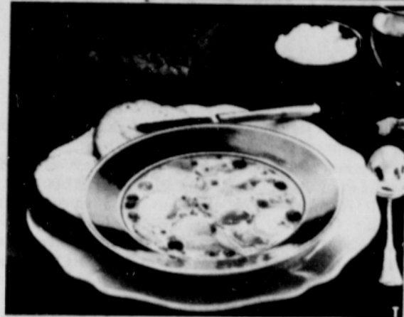
Nothing hits the spot on a chilly winter evening better than hot soup. Soup is always an easy dish for children to make. Throw in a few croutons or let your child season to taste with a variety of herbs.

1 pound hamburger 1 4 oz. can chili 1 small can tomato sauce 1 package corn chips Brown hamburger. Add chili and tomato sauce. Put cornchips in the bottom of a 13" x 9" cake pan and pour hamburger mixture over it. Bake in 350° oven for 25 to 30 minutes. When heated through, remove from oven and sprinkle with: 1 cup shredded cheese shredded lettuce chopped tomato Serve with taco sauce.