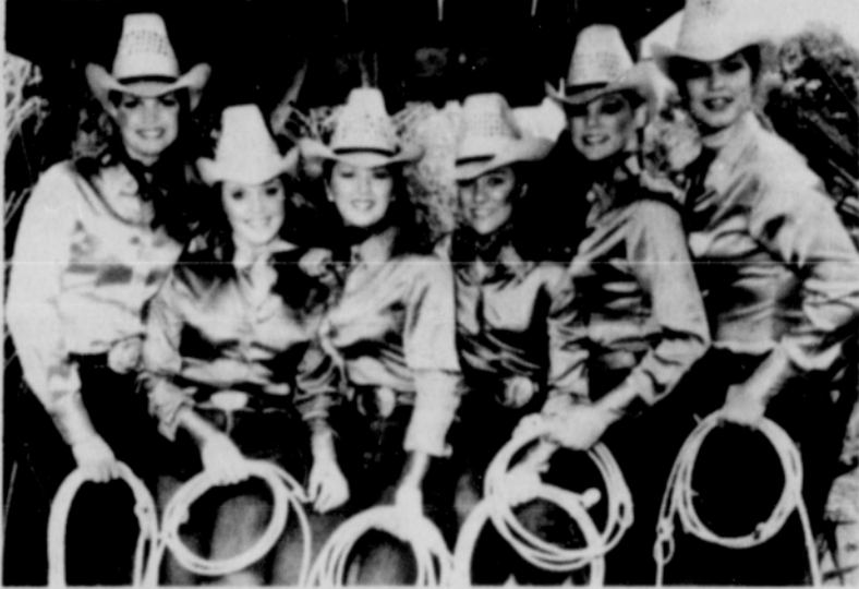
The World's Toughest Rodeo, with all its snortin', buckin', Wild West action and color, combines show-biz extravaganza and big-money athletic competition at Memorial Coliseum, January 21-23.

The girls, who range from 18 to 23, appeared with the World's Toughest Rodeo in Toronto, Washington D.C., Atlanta, and New York's Madison Square Garden in 1981.