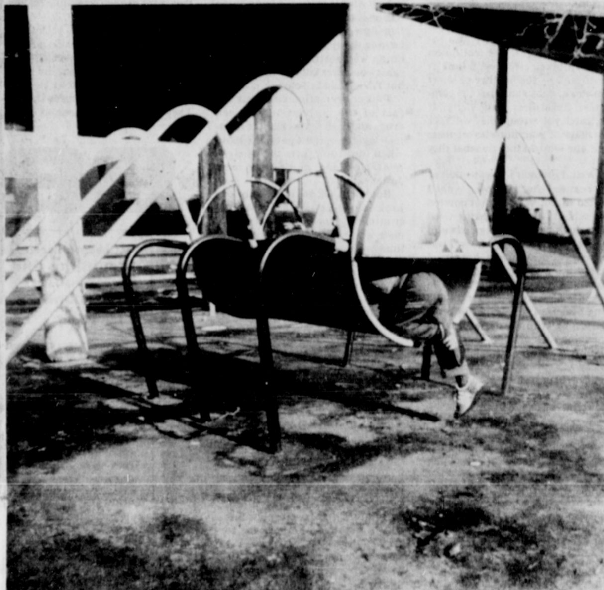
Bug bites man: Curiosity got the best of this young man as he explores the interior of this giant bug who waits patiently on the empty playground.