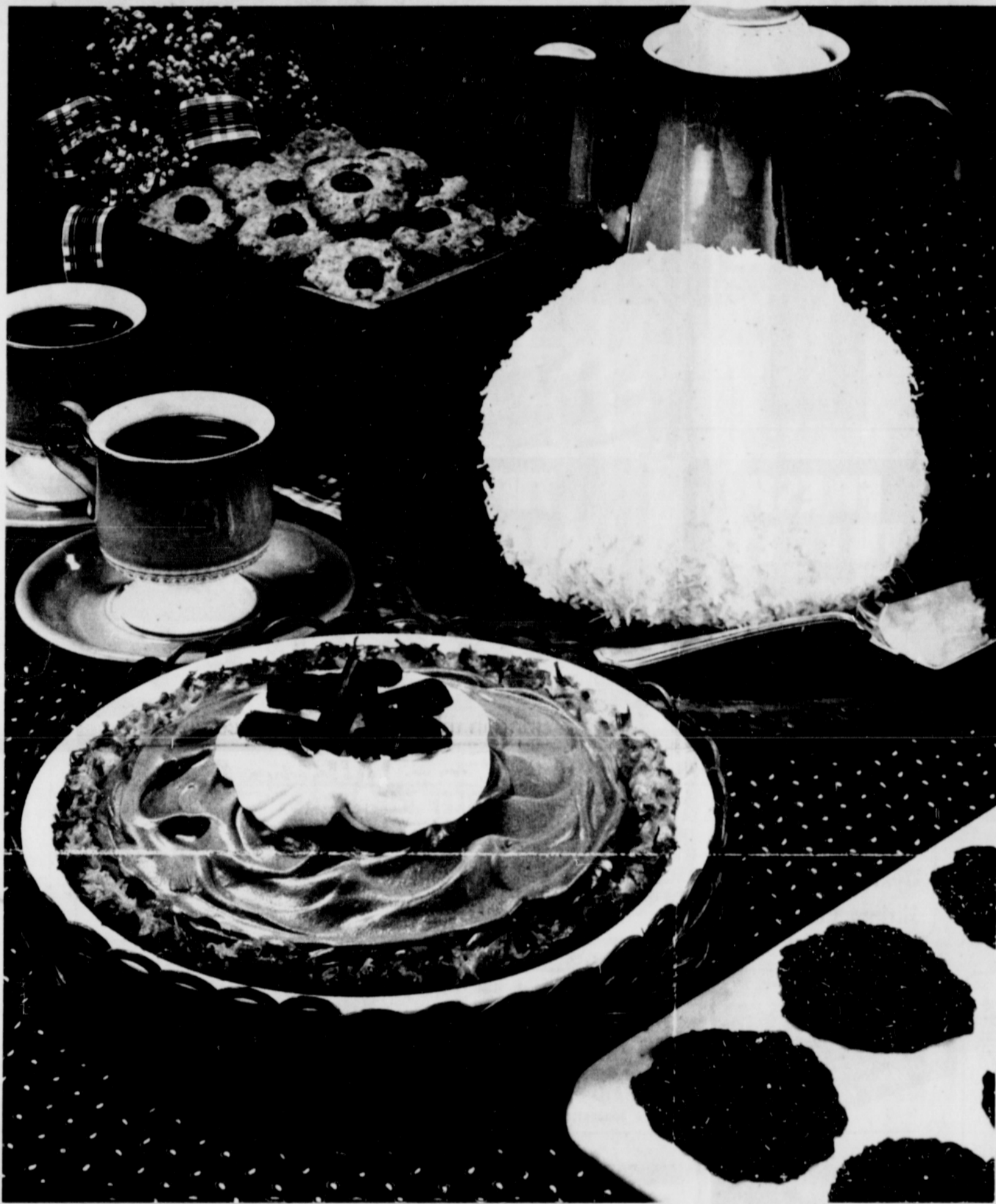
Left to right: Pineapple-Coconut Drops (Top); Snowball Cake (Center); Chocolate Angel Pie and Coconut Lace Wafers.