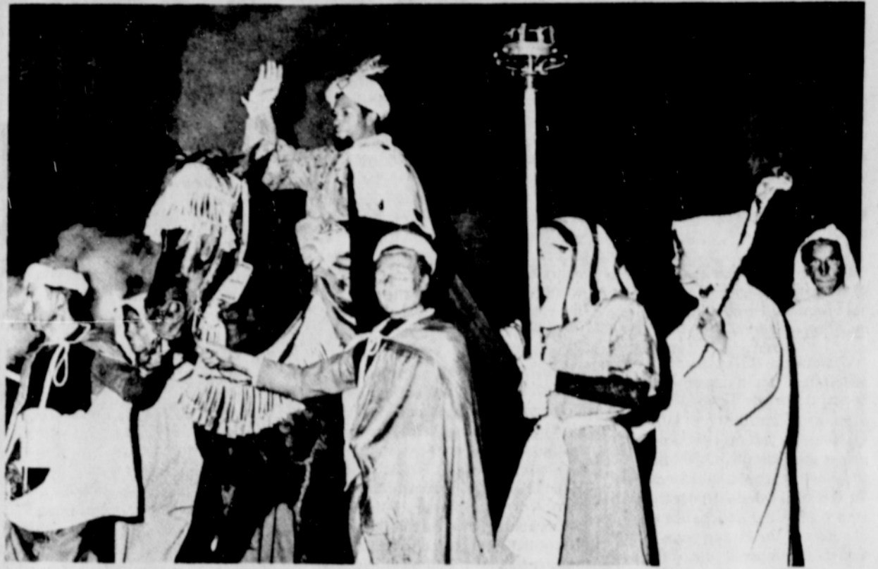
In Spain the Three Kings parade through town accompanied by many children.