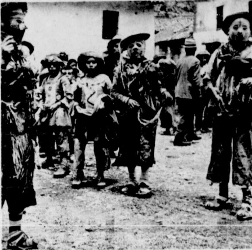
In a mountain village in Peru, people wear masks and costumes on the Day of the Kings.