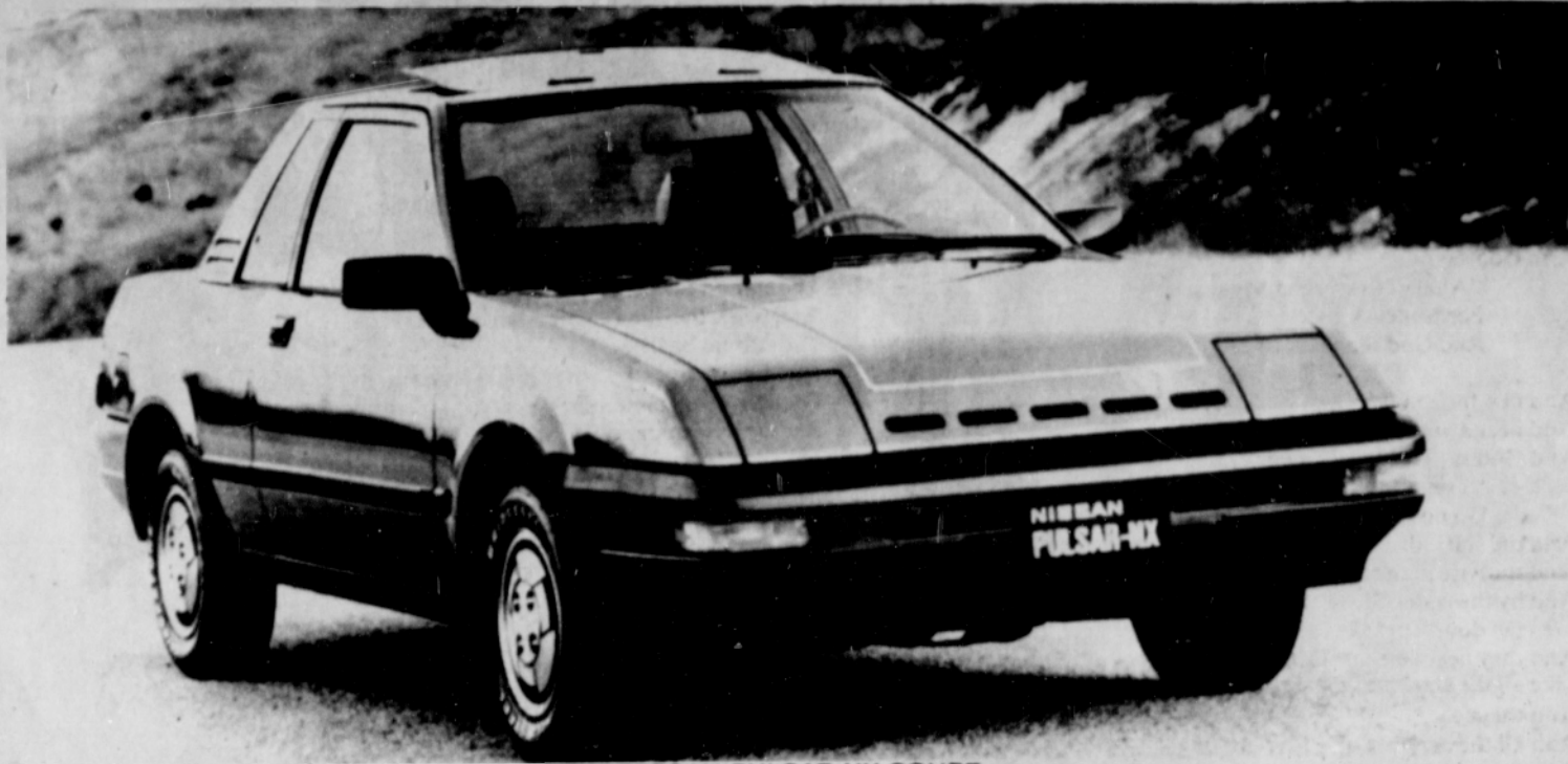
1983 NISSAN PULSAR NX COUPE